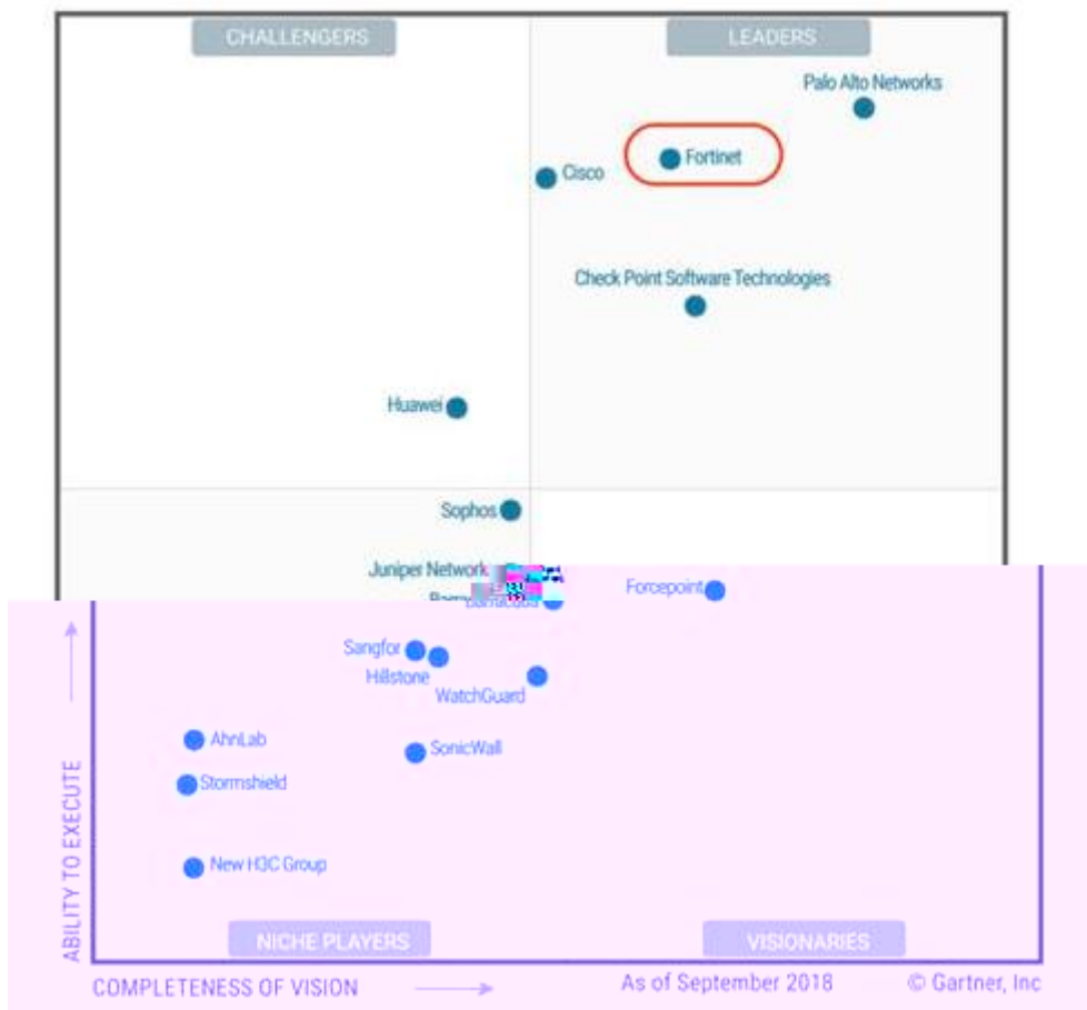
Figure 1. Magic Quadrant for Enterprise Network Firewalls